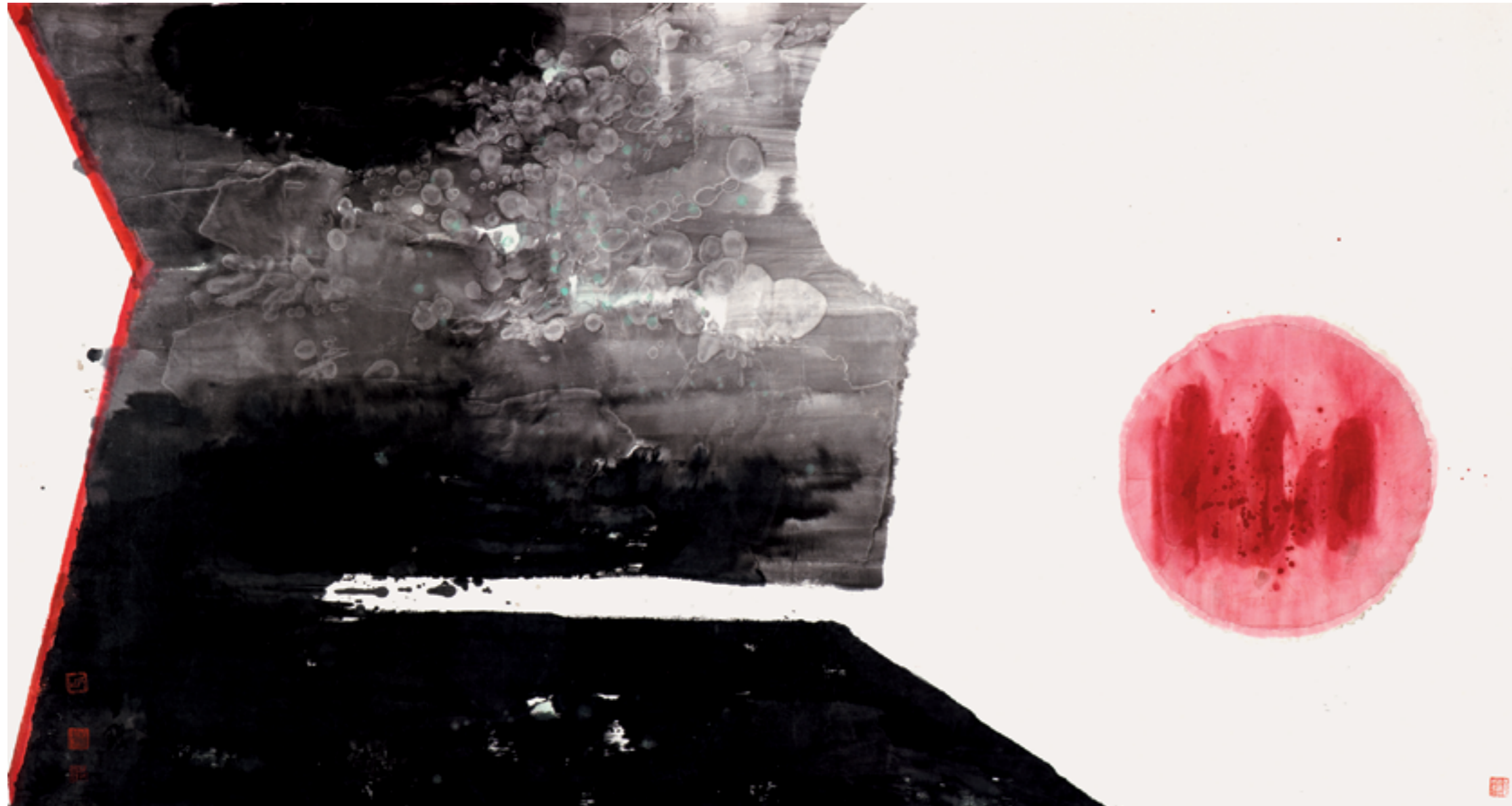
Lui Shou-kwan, Zen Painting (1972)

During this period Lui was exposed to a range of international influences. He was intrigued by the romantic landscapes of the English master Turner (1775-1851) and imbued his own work with similarly evocative portrayals of nature and an atmospheric use of light. In the rich and moody skies of Lui's Victoria Gap (1959), one of the works on show in this month's exhibition, the influence of Turner is clear. The painting marks Lui's