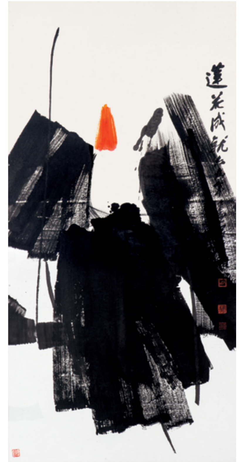
Wucius Wong, Water Represents Ultimate Goodness (2015)

Lui's abstraction reached its zenith in his “wet” and “dry” Zen series. In the wet paintings, lotus flowers and other spiritual symbols are created in blotchy, watery strokes, while in the dry works, such as Zen Painting (1972), the landscape is pared back to heavy, black shapes. This expressive use of brush and ink became known as the New Ink Painting Movement.